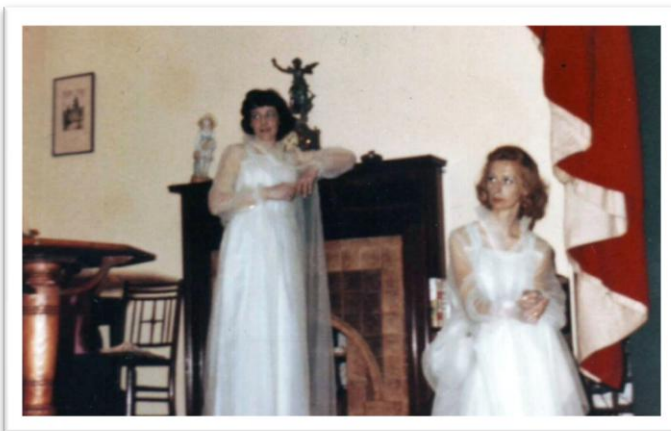
The 1965 séance table bears a remarkable similarity to the 2012 one. Well, if James Bond can re-use his Aston Martin...