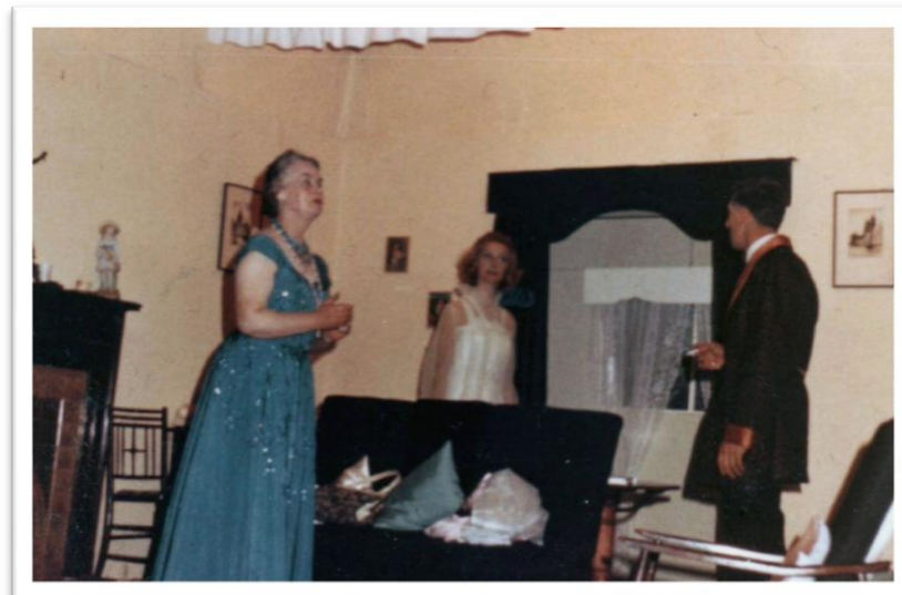
Madame Arcati, sensing the vibrations