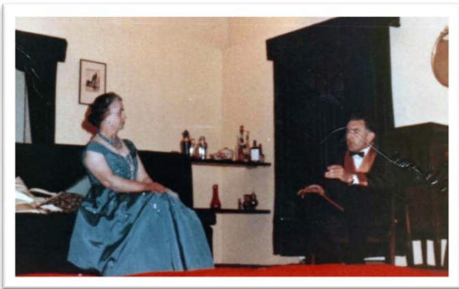
"You're a damn fool, Mr Condomine!"